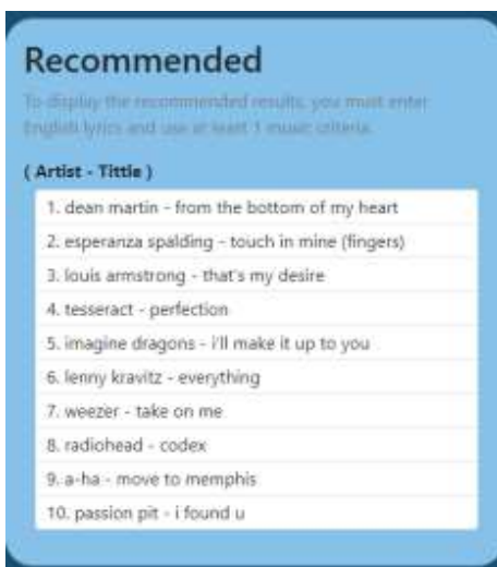
Fig. 3. Output Recommender System

As shown in Figure 4, the system displays 10-best music by ranking. Then users can search for the artist and title of the music on the internet, for example, search for music on Spotify.