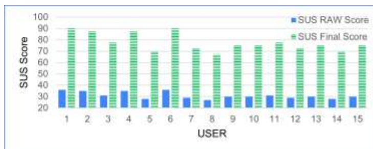
Fig. 3. System Usability Score

In this research uses the System Usability System (SUS) method to measure user satisfaction. SUS has 5 positive questions and 5 negative questions, each odd numbered question is positive and odd numbered question is negative, a total of 10 questions. SUS respondents are given a choice of a scale of 1-5 to answer based on how much they agree with each statement on the product or feature we are testing, a score of 1 (strongly disagree) and a value of 5 (strongly agree). The evaluation of this study involved more than 60 participants (students and workers) aged between 20-23. Users are asked to input the desired lyrics and music criteria, after the user presses the Recommend button, the system will issue a list of 10 artists and music titles based on their ranking order. After that, users can search for music recommended by the system on the internet. If the results of the recommendations are in accordance with what they want, then the user gives a positive satisfaction value. Figure 3 is an example of the scores of 15 participants, there are SUS RAW Score and SUS Final Score. SUS Final Score is obtained from SUS Raw Score multiplied by 2.5. The results of the analysis of 60 participants obtained an SUS score of 83.65 and were included in the EXCELLENT category with grade scale A.