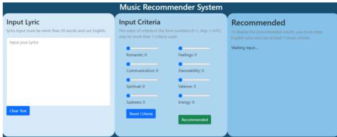
Fig. 2. User Interface

For example, user input the lyrics 'I can make you fall in love with me Even if you don't love me give me a little time Let love come because you're used to it Save the rose I gave Maybe its scent inspires you to know me first Before you spit on me Before you tear my heart' and criteria (Romantic: 0.5, Feelings: 0.3, Sadness: 0.15), then the output shown in Figure 3.